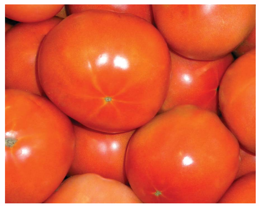
The new quality standard for the Fall and Spring!